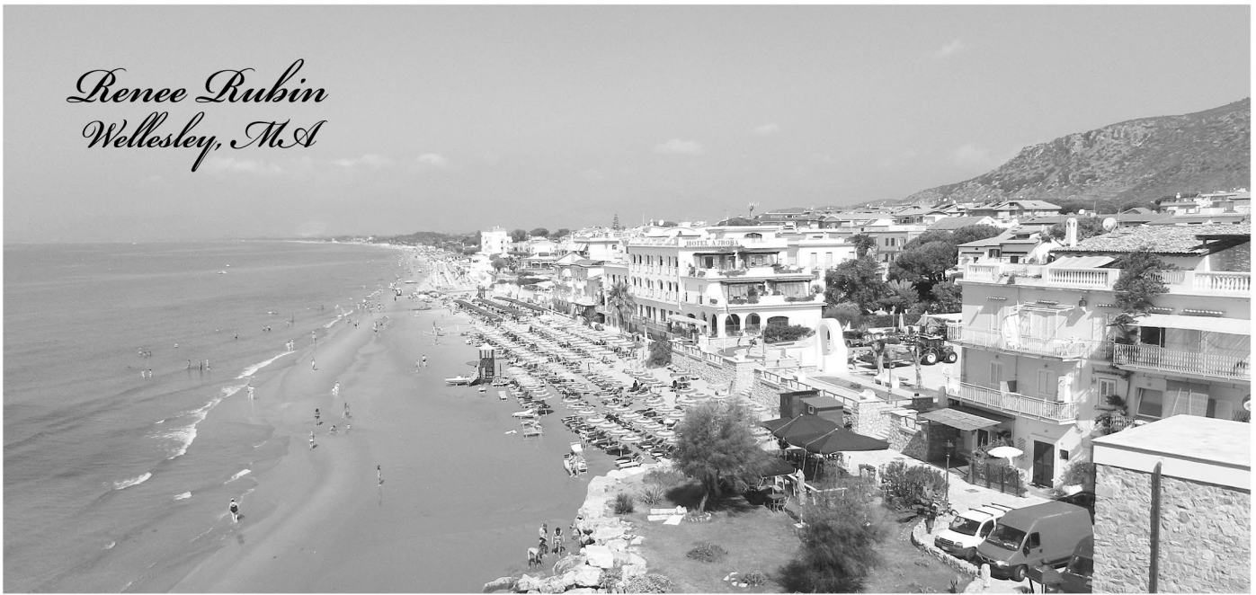
The beach at Sperlonga.