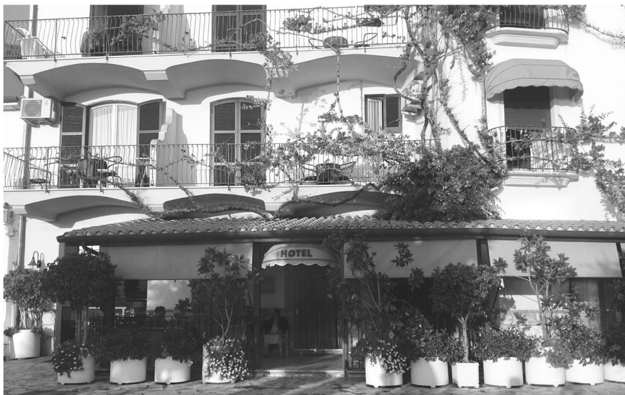
Hotel Marconi, our home for two weeks.