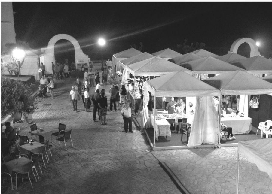
Booths set up for the Saponi di Mare festival in Sperlonga.

out of her way to ensure I had delicious meals.